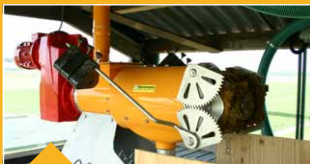
STATIONARY SLURRY SEPARATORS

Veenhuis' products for slurry separation: