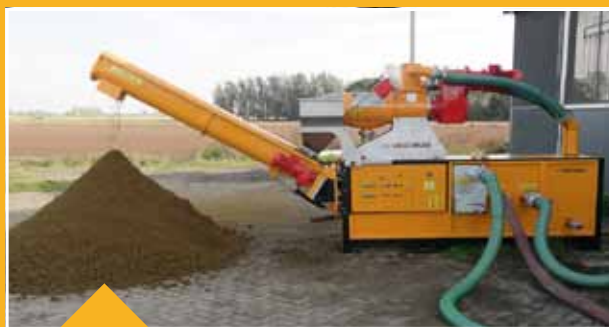
MOBILE SLURRY SEPARATORS