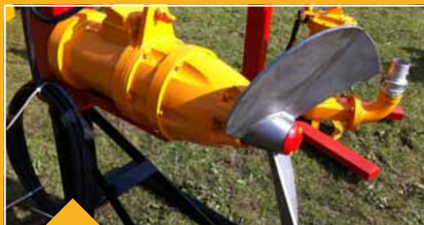
MIXERS AND PUMPS